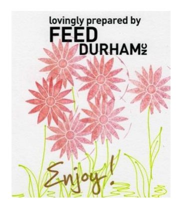
Feed Durham NC

Feed Durham is a scrappy, determined mutual aid collective that came together in answer to mounting hunger in the Durham area, due to COVID. Our project intention is to train so that we can provide food for protests and encampments, to train and skill share so that we can thrive during times of unrest, to move resources from neighbors that have to neighbors that need.